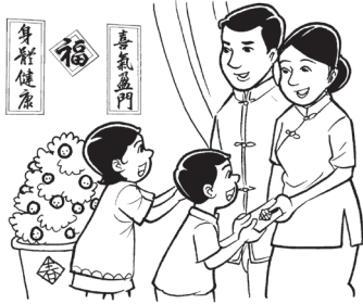
Chinese New Year