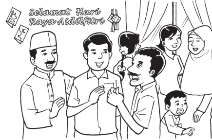
Hari Raya Aidilfitri